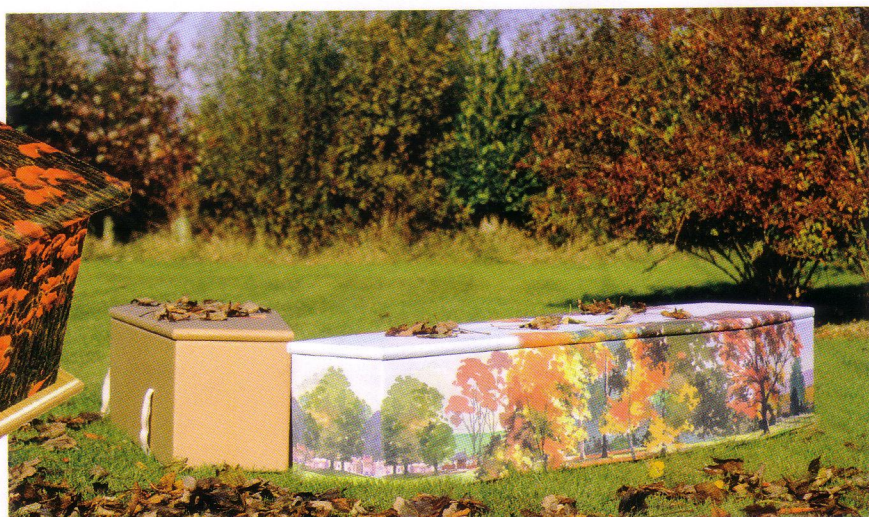
In 2008, Colourful Coffins launched its range of 100% recycled cardboard coffins